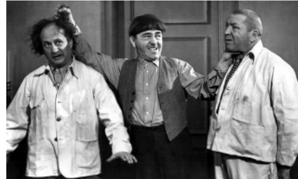
Dewey, Cheetum & Howe, LLP